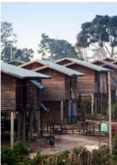
Resettlement village, Nakai Plateau, Khammoune Province, Laos

Coping strategies tend to involve the family and since families decide what to do in times of crisis, strategies vary with households. Within the household, the effects of the strategies also vary. For example, if a family decides to consume less food, this may bring into play the gender or life cycle issues discussed earlier as a mother may share her ration with her children or the children under five may miss out on the calories, vitamins and micronutrients they need for healthy growth.