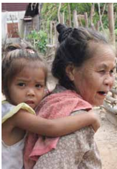
Migrant workers often leave their young children with their parents as they search for work elsewhere