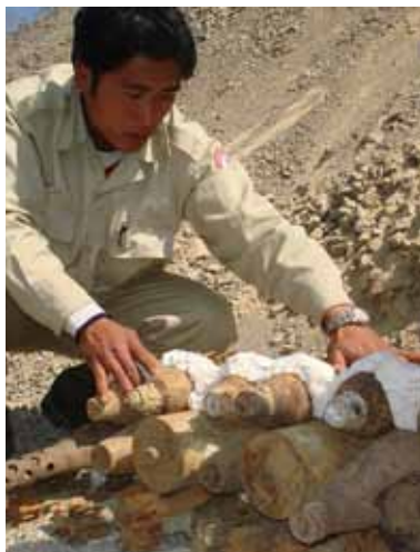
UXO Lao SEOD technician preparing UXO for destruction, 2007